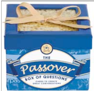
http://www.thejewishweek.com/sites/default/files/images/2010/03/box_0.gif The Passover Box of Questions