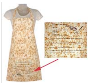
http://www.thejewishweek.com/sites/default/files/images/2010/03/apron_0.gif Wear it and cook from it: The ingenious