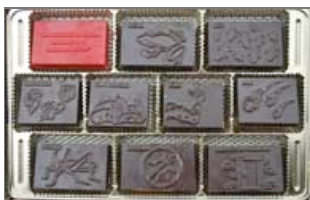
http://www.thejewishweek.com/sites/default/files/images/2010/03/chocolates1_0.gif The Passover Chocolate Ten Plague