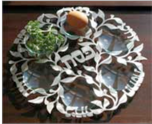
http://www.thejewishweek.com/sites/default/files/images/2010/03/seder_plate_0.gif Melanie Dankowicz's metal seder plate