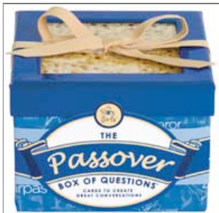
http://www.thejewishweek.com/sites/default/files/images/2010/03/box_0.gif The Passover Box of Questions